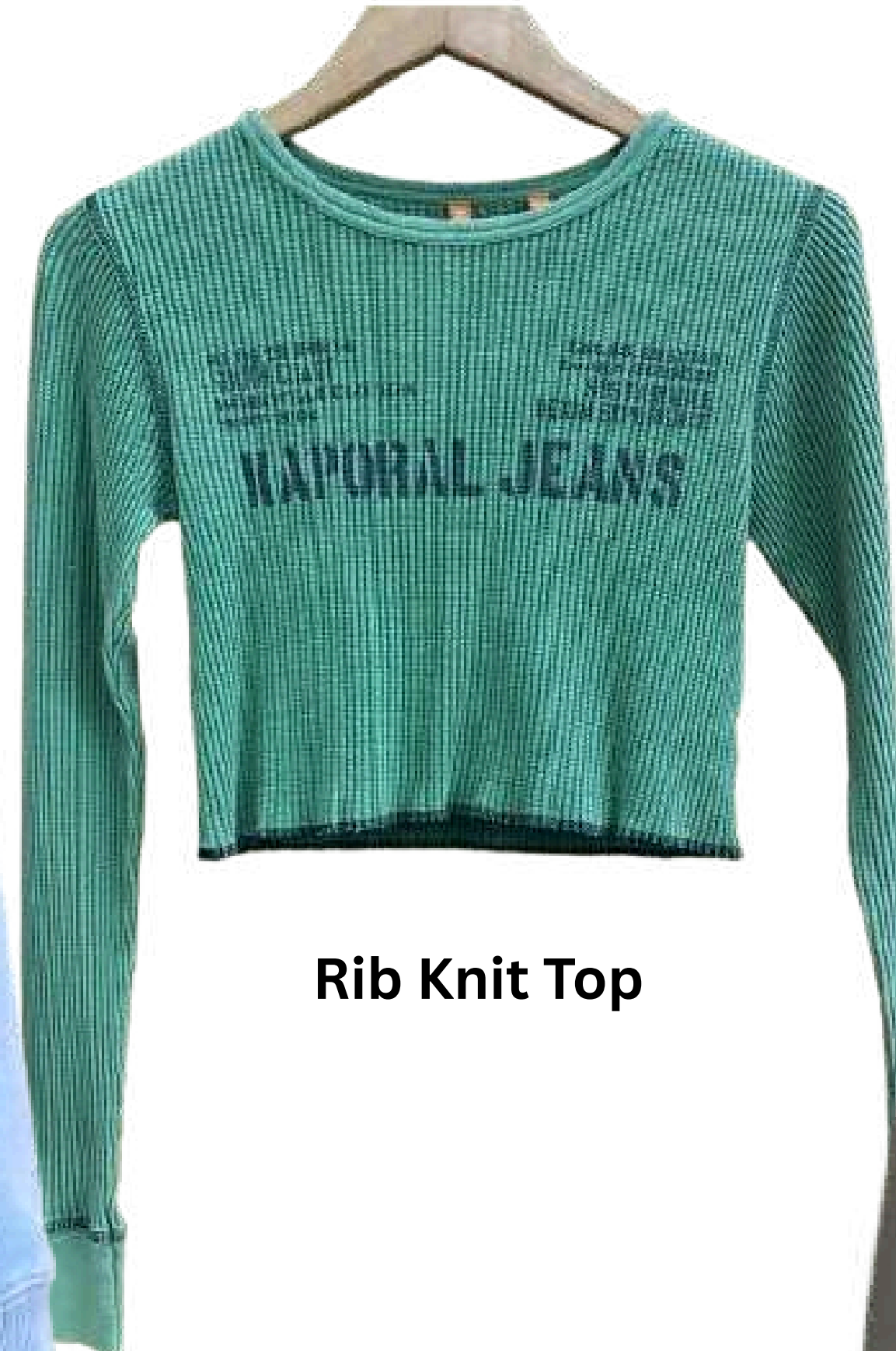
Rib Knit Top