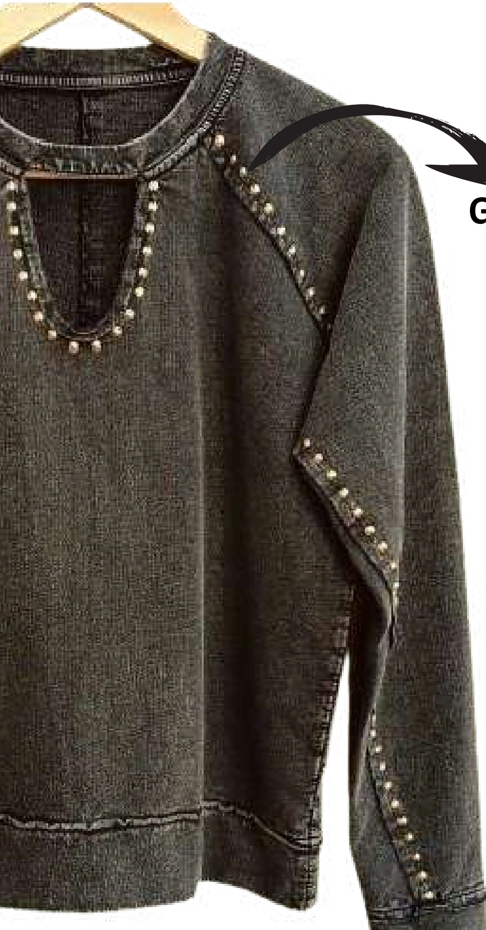
Gold Studs Work