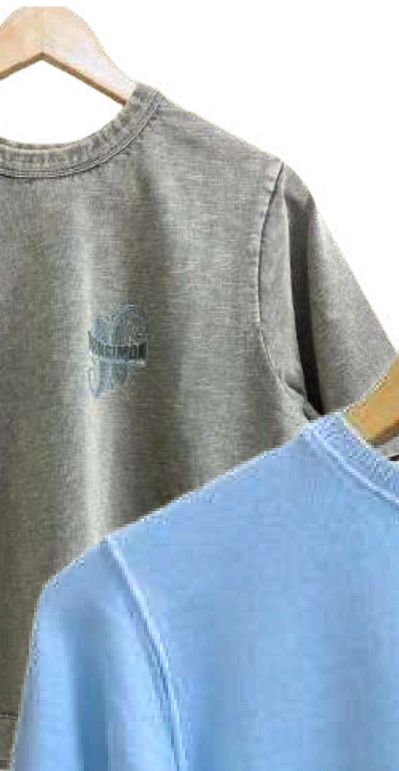
Double Jersey T-shirt